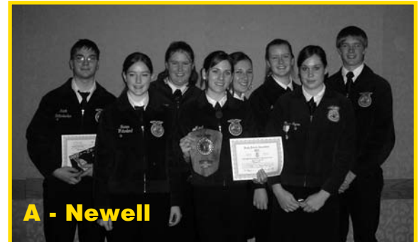
A - Newell

(A) Parliamentary Procedure is sponsored by South Dakota Farmers Union. 1. Newell; 2. Harrisburg; 3. McCook; 4. Lennox; 5. Highmore