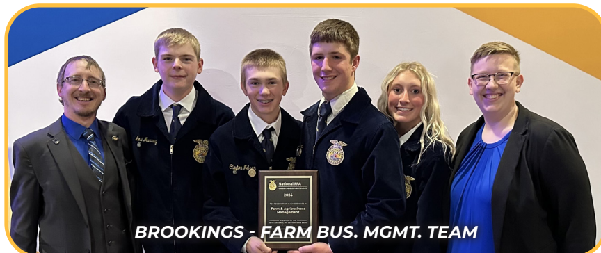
BROOKINGS - FARM BUS. MGMT. TEAM