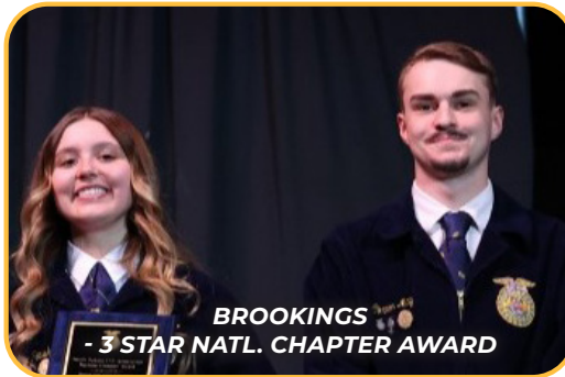
BROOKINGS - 3 STAR NATL. CHAPTER AWARD