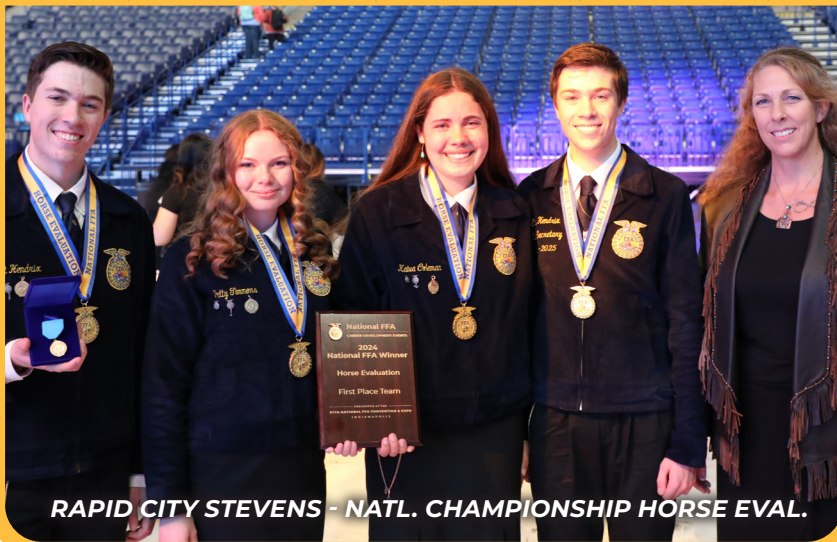
RAPID CITY STEVENS - NATL. CHAMPIONSHIP HORSE EVAL.

This is a 1ST TIME ACHIEVEMENT for any SD FFA chapter.